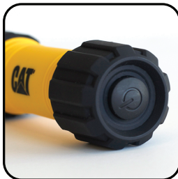
Weather Resistant Power Switch Cover

Cat lights are built to get the job done—at work and beyond.