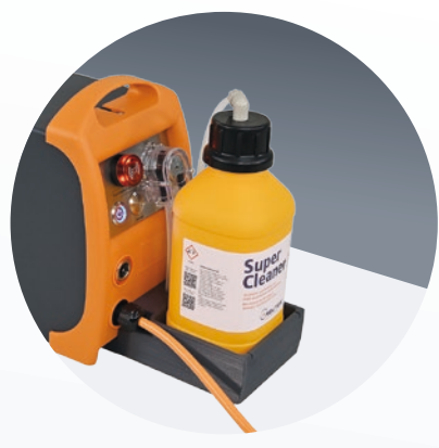
The rear of the Cleanox 5.0 with holder for electrolyte reservoir, servo pump and level sensor.