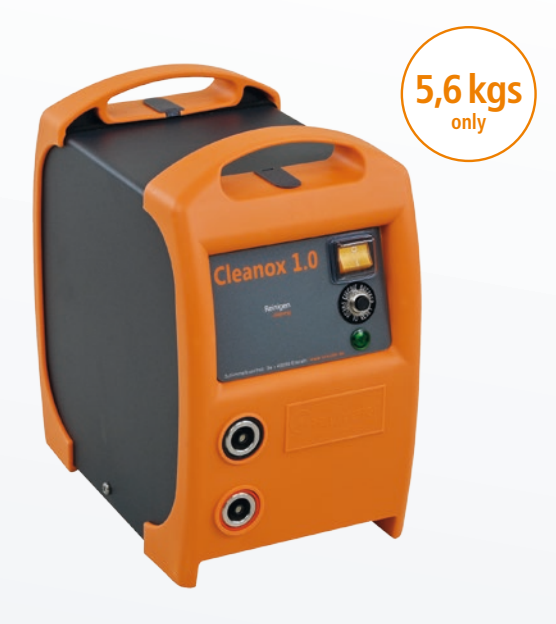
Cleanox 1.0: The Lightweight

The Cleanox family is designed for metal workers who want to use their cleaning equipment flexibly — whether in the workshop or on the road during assembly. Plastic and aluminium make the three devices surprisingly light and extremely robust. At the same time, they are among the most powerful on the market: 80 A continuous current at 100 % duty cycle, plus pulse currents of over 200 A — stunning values, that make our competitors nervous.