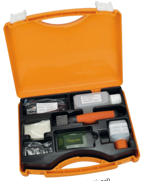
Marking set (optional)

Our sets contain everything, so that you can get started straight away: Teflon handle with earth cable, carbon fibre brush, different electrolytes, transport box etc.