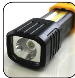
Dual light: Flood & Beam