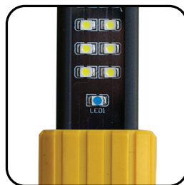
Battery Charge Level Indicator