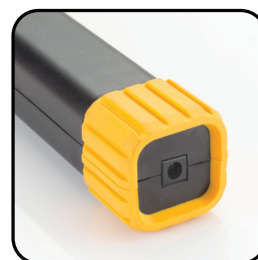
Protected Charging Port

Cat lights are built to get the job done—at work and beyond.